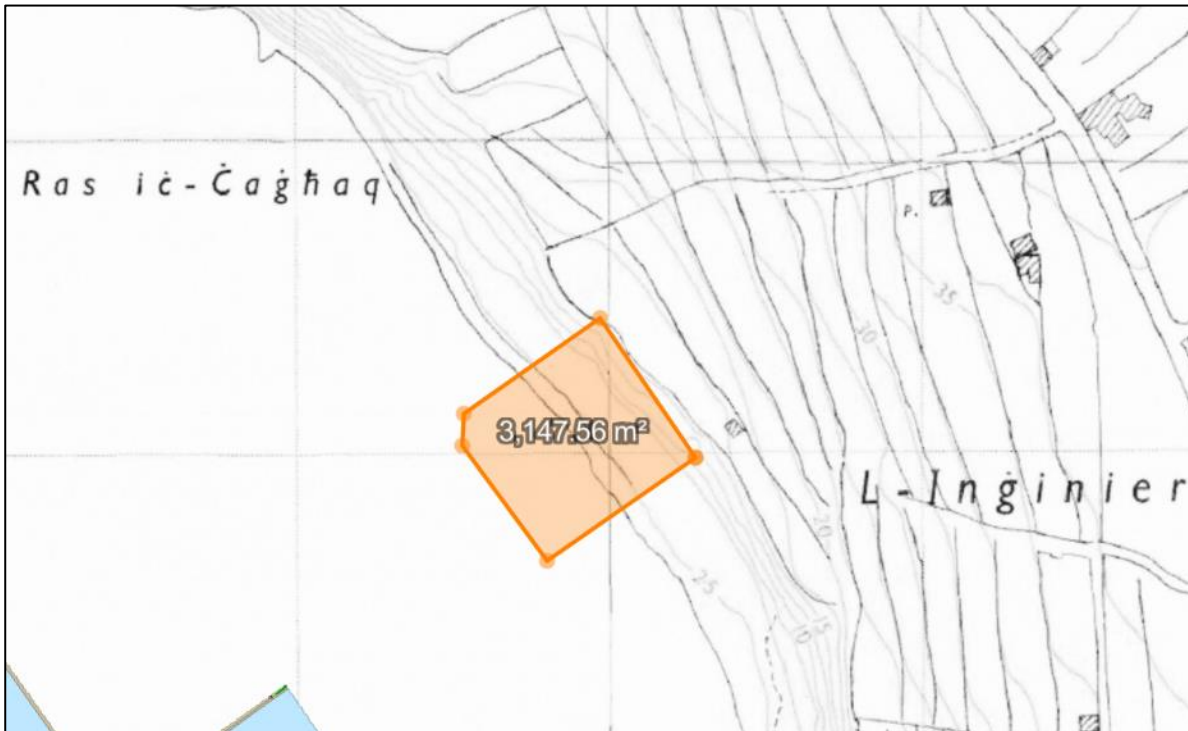
Figure 2: Site 2 superimposed over 1968 survey sheets, in relation to original shoreline.

Site 2 measures approximately 70m x 45m, for a total area of circa 3,150m 2 . The area is a portion of land which has not yet been developed and has been intermittently used as a temporary storage area of material and equipment.