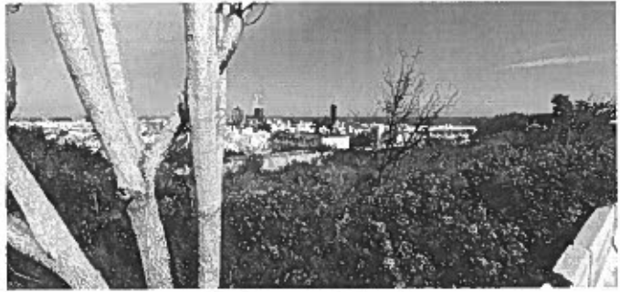
The land in St Julian's

The Prime Minister recalled that in its first year, Project Green worked on 40,000 square meters of open spaces, planting 4,000 trees.