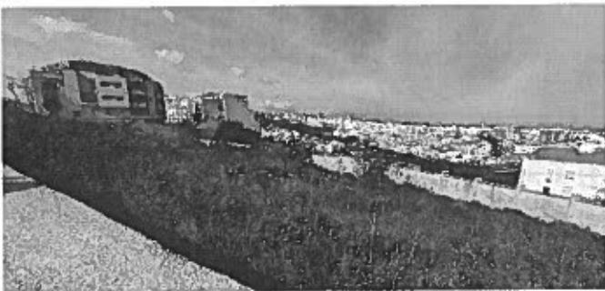
The land in St Julian's

The 8,000 square meters of land for these four projects form part of 20,000 square meters of land around the country that will be turned into open spaces.