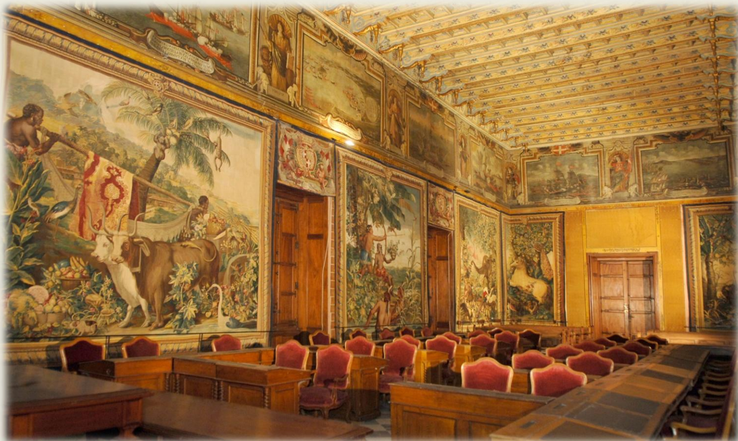
Is-Sala tal-Arazi: Post ta' ħidma tal-Kunsill tal-Gvern mid-dhul fis-seħħ tal-Kostituzzjoni tal-1849. Din is-Sala serviet ukoll biex fiha ltaqa' l-Parlament Malti bejn l-1921 u l-1976.