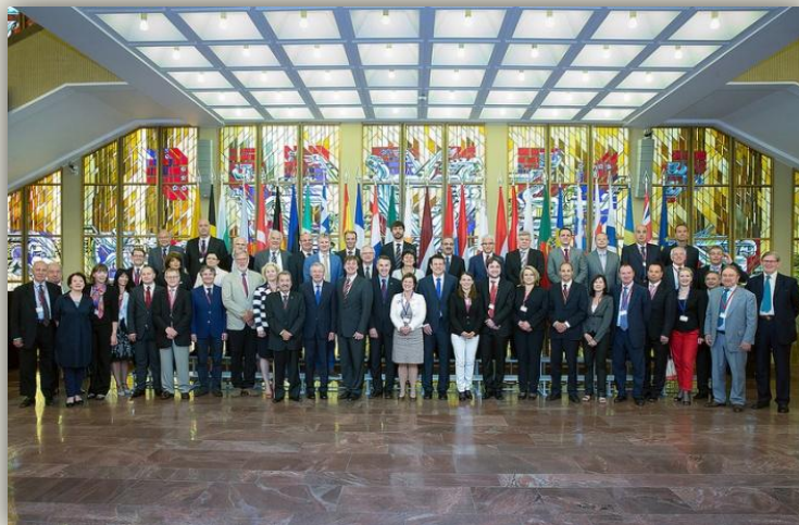
Il-laqgħa tač-Chairpersons tal-COSAC - Vilnius 7-8 ta' Lulju 2013

Huwa għalhekk ippropona li dawn ir-regoli godda jiġu diskussi fid-dettall u bir-reqqa ma' kull Stat Membru.