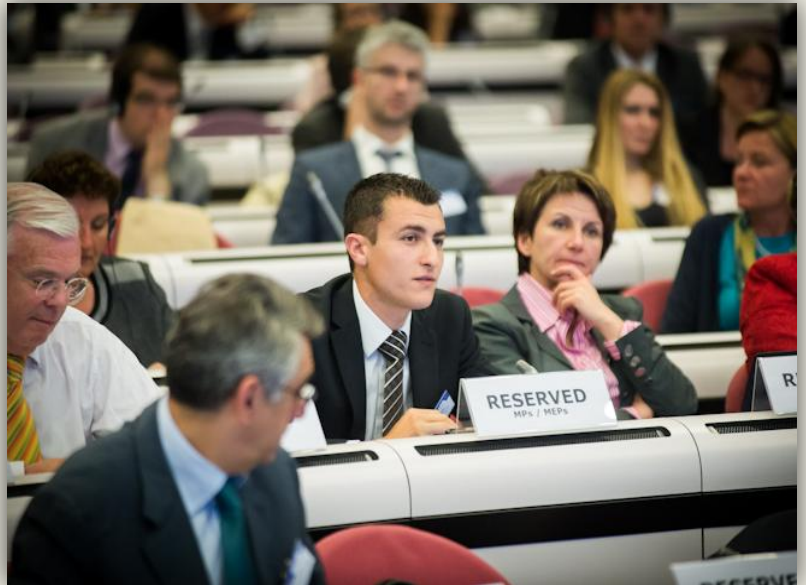
Hon. Silvio Schembri at the European Commission Conference in Brussels

During the conference Hon. Schembri said that the European Commission should not just be taking into account the interests of the larger Member States; the interests of smaller Member States, like Malta, also have to be safeguarded at all times. Hon. Schembri emphasised also that the new rules concerning the Banking Union should be drawn up in the context of the Maltese reality, as otherwise the impact on Malta could be significant. He therefore suggested that these new rules be discussed in detail with every Member State.