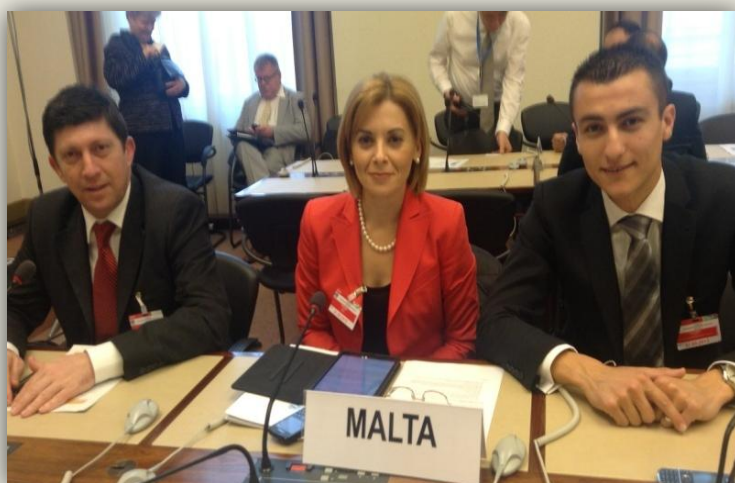
Hon. Justyne Caruana, Hon. Silvio Schembri and Hon. Stephen Spiteri in Parliamentary Assembly of the Mediterranean meetings

Another meeting in the framework of the Parliamentary Assembly of the Mediterranean was held in Rome on 6 June. The Deputy Speaker Hon. Ċensu Galea, together with Hon. Justyne Caruana, Head of Delegation of the Parliamentary Assembly of the Mediterranean and Chair of the ad hoc Committee on the Middle East of the same Assembly, took part in this special meeting of the Bureau where various issues were discussed, including specifically the worrying situation in Syria.