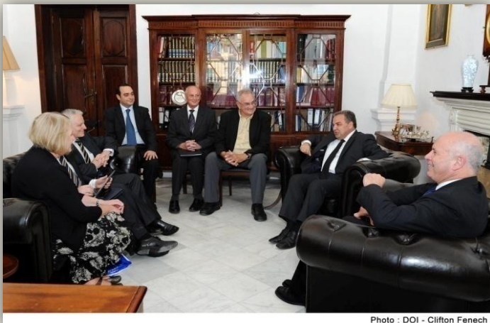
Meeting with the State Parliament of Victoria Parliamentary Friendship Group

The work of these groups is often based on an agreement, at times informal, between the parliaments. The aim of these groups is for their members to establish contacts with their counterparts in order to enable discussions on matters that are of interest to both countries. The meetings of the parliamentary friendship groups are often held in a less formal manner than those held by the government.