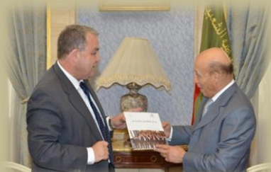
L-iSpeaker jipprezenta kopja tal-ewwel ħarġa ta' mill-Parlament lill-iSpeaker tal-Assemblea Legizlattiva tal-Alġerija

Fi tmiem il-laqgħa mal-iSpeaker tal-Assemblea, intlaħaq qbil li jitwaqqaf grupp interparlamentari ta' ħbiberija Malta-Alġerija bil-għan illi jiġu mistħarrġa oqsma li jistgħu jibbenefikaw minn ħidma mill-qrib u koperazzjoni bejn iż-żewġ naħat.