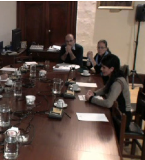
Social Affairs Committee Meeting No. 12 of 27 November 2013, discussing the effect of domestic violence.

This Committee has met once since, when it welcomed the Minister for Home Affairs and National Security, Hon. Manuel Mallia, as a guest speaker who gave a general exposition on the various matters relating to irregular immigration. The issues regarding irregular immigration are wide-ranging, starting from issues regarding the point of departure of an irregular immigrant, the issue of sea voyages on unseaworthy vessels, criminal aspects of human trafficking, search and rescue obligations, international conventions, detention policy and many more. In order to give structure to forthcoming discussions the Committee will meet shortly to discuss a work program and schedule of visits to detention centres for the coming months.