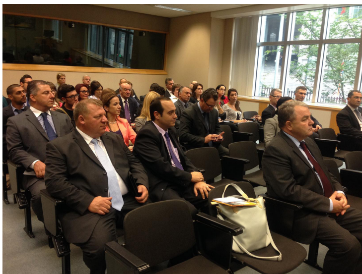
L-iSpeaker imexxi delegazzjoni tal-Parlament Malti fi żjara ta' informazzjoni fl-Istituzzjonijiet Ewropej fi Brussell.