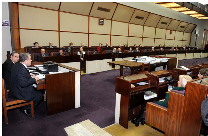
L-iSpeaker jippresjedi l-Parlament tan-Nanniet li sar fis-17 ta' Diċembru 2013

Fl-okkażjoni tas-Sena Ewropea taċ-Ċittadini, nhar is-Sibt, 23 ta' Novembru 2013, saret sessjoni speċjali tal-Parlament bejn il-Membri Parlamentari, il-Membri Parlamentari Ewropej u rappreżentanti tas-soċjetà ċivili dwar proposti li joħorġu minn abbozz ta' Ċarter dwar iċ-Ċittadinanza tal-Unjoni Ewropea u dwar ir-Rapport tal-Kummissjoni Ewropea dwar iċ-Ċittadinanza 2013. Din l-attività kienet parti mill-Fiera taċ-Ċittadini organizzata mill-Malta-EU Steering and Action Committee (MEUSAC), li huwa l-koordinatur nazzjonali tas-Sena Ewropea taċ-Ċittadini 2013. Waqt id-dibattitu, ippresedut mid-Deputat Speaker, l-Onor. Ċensu Galea, tqajmu diversi punti li l-MEUSAC kienet se tressaqhom quddiem l-awtoritajiet konċernati b'ħall-European Citizen Action Service, l-organizzazzjoni li qed tippromovi iċ-Ċarter Ewropew taċ-Ċittadinanza.