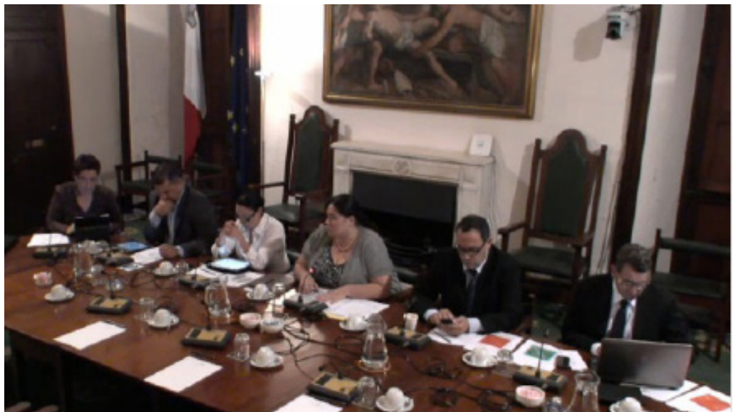
Laqgħa Nru 7 tal-Kumitat Permanenti dwar l-Affarijjet Soċjali tas-17 ta' Ottubru 2013, fejn ġew diskussi żewġ rapporti ppreżentati mill-GWU u ittra mill-Onor. Bezzina dwar incidenti tat-traffiku.

Il-membri li kienu preżenti waqt iż-żjara f'Dar Qalb ta' Ġesù tkellmu ma' bosta nisa li kienu lesti jaqsmu magħhom l-esperjenzi, id-diffikultajiet u t-tħassib tagħhom, fejn anki kellhom l-opportunità li jidentifikaw in-nuqqasijiet fis-sistema li saru jafu tant tajjeb bit-tama li xi darba din tittejjeb għall-ġid tagħhom u tal-oħrajn. Barra minn hekk, kien hemm organizzazzjonijiet oħrajn interessati, inklużi NGOs, li ntalbu jagħtu l-kontribut tagħhom u l-Kumitat kellu l-pjaċir li jara kemm intlaqgħet tajjeb id-diskussjoni tiegħu dwar il-kwistjoni.