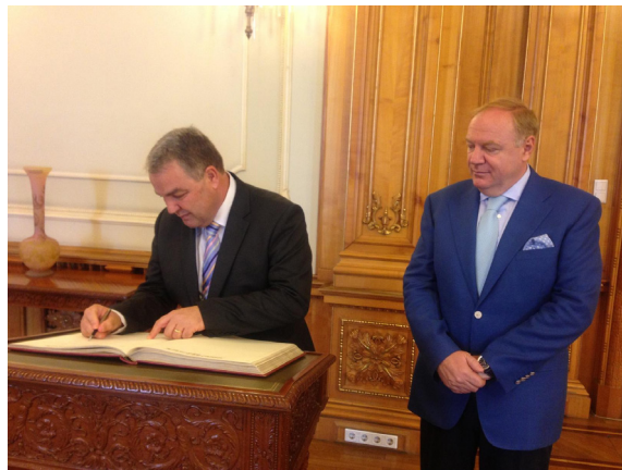
Żjara ta' Kortesija minn Delegazzjoni Parlamentari Maltija mmexxija minn l-iSpeaker lil President tal-Parlament Rumen - 18.9.13

Mal-Ministru responsabbli mill-baġit, id-delegazzjoni Maltija tkellmet dwar is-setturi ekonomiċi li fihom jista' jkun hemm kooperazzjoni bejn iż-żewġ naħat, u l-iSpeaker Farrugia ssuggerixxa li, kif kien sar mas-Slovakkja, Malta tgħin meta r-Rumanija tiġi biex tadotta l-ewro. Id-delegazzjoni Maltija ltaqgħet ukoll mal-Viċi Prim Ministru, Gabriel Oprea. Fil-laqgħa, in-naħa Maltija wriet l-apprezzament tagħha għall-fatt li l-Gvern Rumen offra li jieħu 10 refuġjati minn Malta f'ġest ta' solidarjetà ma' Malta fil-problema li qed taffaċċja ta' immigrazzjoni irregolari. L-iSpeaker Farrugia tenna li dan il-ġest, meta jiġi attwat jibgħat messaggġ ċar lill-Istati Membri l-oħra ta' kif għandha tkun is-solidarjetà bejn il-pajjiżi.