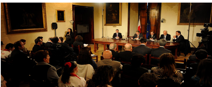
Parliament for persons with disability - 12 December 2013