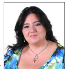
Hon. Deborah Schembri Chairperson - Social Affairs Committee

The Social Affairs Committee (Immigration) is composed of Hon. Deborah Schembri (Chairperson), Hon. Jason Azzopardi, Hon. Claudette Buttigieg, Hon. Michael Falzon, Hon. Marlene Farrugia, Hon. Christopher Fearn and Hon. Carmelo Mifsud Bonnici.