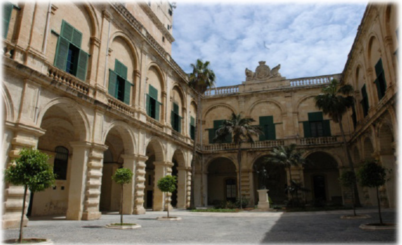
Il-Bitha ta' Nettunu: Fl-1861 l-istatwa ta' Nettunu ngabet hawnhekk mill-pixkerija fin-nofsinhar ta' Malta. Il-funtana l-kbira li hemm wara din l-istatwa fiha l-arma tal-Gran Mastru Perellos.