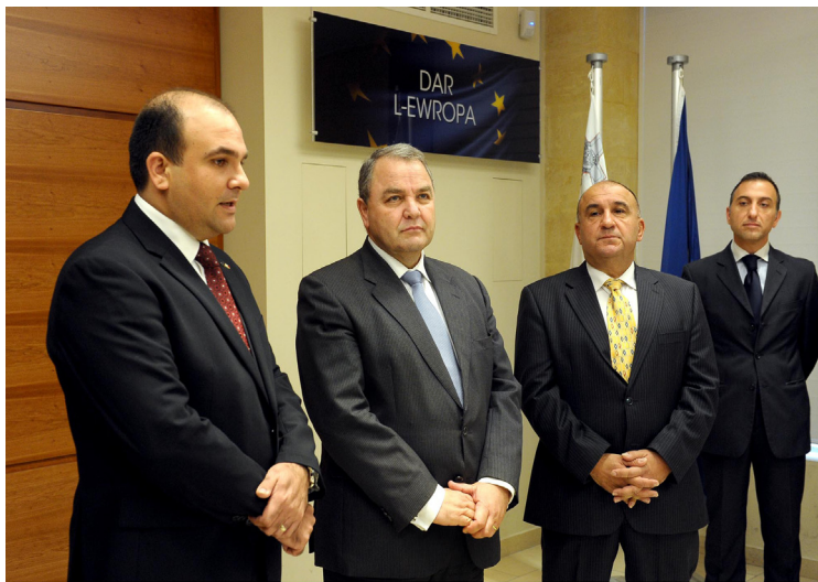
L-iSpeaker iżur Dar l-Ewropa