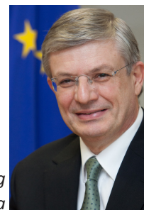
Dr Tonio Borg Kummissarju Ewropew għas-Saħħa

Kif għedt fil-Prefazzju għall-White Paper f'Settembru 2012, il-White Paper mhijiex imnaqqxa fil-ġebel. Hija biss proposta, li tista' tiffirma l-bażi għal dibattitu produttiv b'suġġerimenti, żidiet u emendi li għandhom igawdu l-aktar kunsens wiesa' possibbli. Billi fil-prinċipju kien hemm qbil mill-forzi politiċi kollha u mill-iSpeaker tal-Kamra, wieħed jittama li din ir-riforma tant mistennija tal-ogħla istituzzjoni tal-pajjiż tiġi implimentata mill-aktar fis. Sabiex jintlaħaq dan l-għan, jeħtieġ li jkun hemm ir-rieda tajba tal-Membri Parlamentari, immexxija b'għaqal mill-iSpeaker.