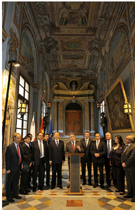
The Speaker addressing a press conference during a visit by a delegation of the Chinese People's Political Consultative Conference