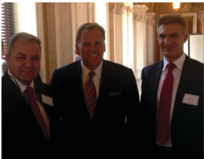
L-Ispeaker Anġlu Farrugia u l-Kelliem u Whip tal-Gvern, l-Onor. Carmelo Abela flimkien mal-President tal-Kumitat tal-Kungress Amerikan dwar l-Intelliġenza, l-Onor. Mike Rogers

L-Ispeaker kien akkumpanjat mill-Onor. Carmelo Abela, Kelliem u Whip tal-Gvern. Id-delegazzjoni Maltija ssieħbet ma' għadd ta' parlamentari minn numru ta' pajjiżi Ewropej u oħrajn, inklużi l-Awstrija, il-Kroazja, l-Estonja, il-Finlandja, il-Georgja, il-Ġermanja, l-Ungerija, l-Italja, il-Montenegro, il-Portugall, ir-Rumanija u r-Renju Unit.