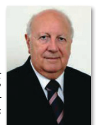
Mr Anton Tabone was first elected to Parliament in 1966 and served as an MP for more than 42 years. He was appointed the first Minister for Gozo between 1987 and 1996 and also served as Speaker of the House between 1998 and 2008.

On a personal note I would like to state how truly privileged I feel to have lived those parliamentary experiences which led to the events that built and fostered the Malta and Gozo we know today—a free independent republic within the European Union.