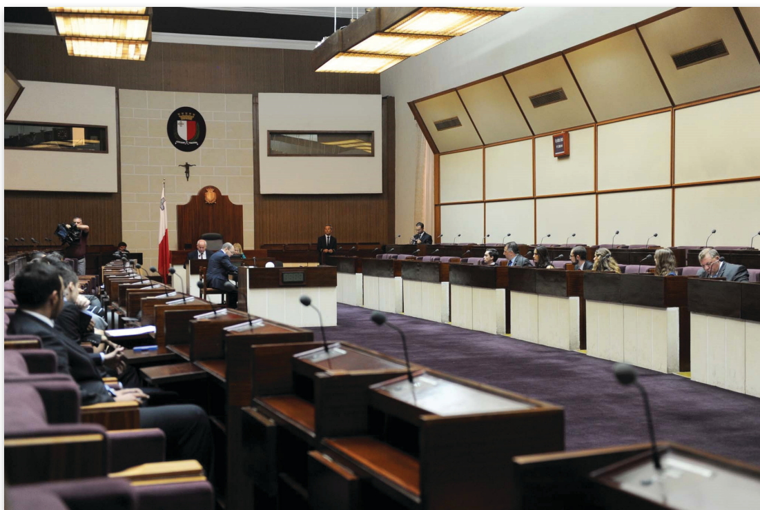
L-edizzjoni tal-2014 tal-Parlament taż-Żgħażagħ li nżammet fis-Sala tal-Parlament

Is-sessjoni ta' din is-sena kienet ippreseduta mid-Deputy Speaker, l-Onor. Ċensu Galea, u għaliha attendew numru ta' Membri Parlamentari miż-żewġ naħat tal-Kamra.