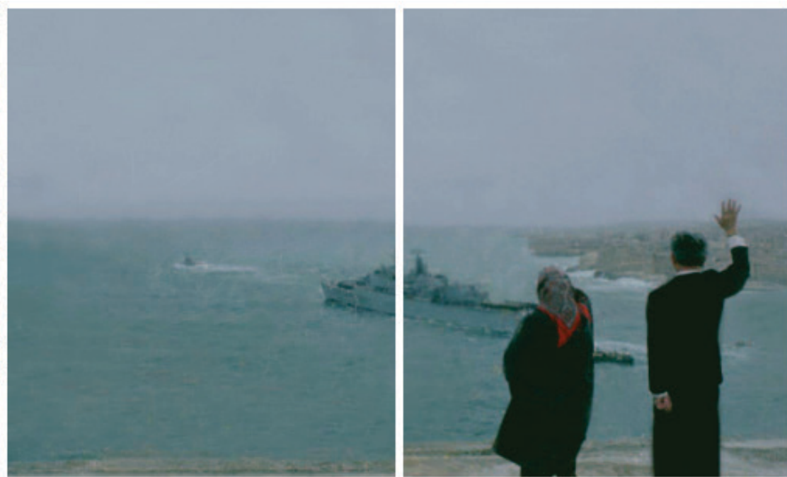
Il-President tar-Repubblika Anton Buttigieg ixejjer lill-aħħar vapur tal-Flotta Navali Ingliża li ħalla Malta fil-31 ta' Marzu 1979

President of the Republic Anton Buttigieg waving at the last British Navy ship leaving Malta on 31 March 1979