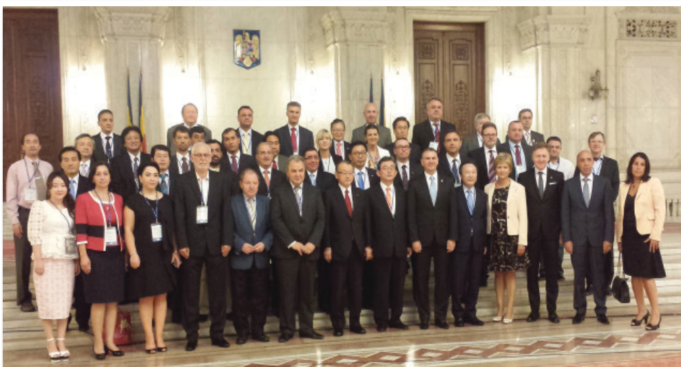
Family photo of the participants of the 11th General Meeting of the International Parliamentarians' Coalition for North Korean Refugees and Human Rights (IPCNR)

At the end of the meeting, the delegates approved the 11th Joint Statement of the ICPNKR. During the closing session of the meeting it was agreed that the meeting in 2015 will be hosted by Austria.