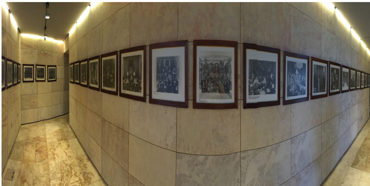
Ġabra ta' ritratti li jagħtu ħarsa storika lejn il-Parlament matul is-snin. Dawn ir-ritratti jinsabu fid-daħla għall-iStrangers' Gallery.