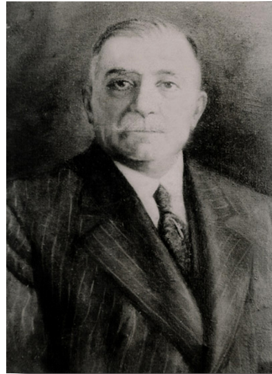
Joseph Howard - First Prime Minister of Malta

In the remaining years prior to World War Two and during the war years the political situation remained firmly under full British control and the Maltese had to wait till 1947 to once again be able to have some say in the running of their own country.