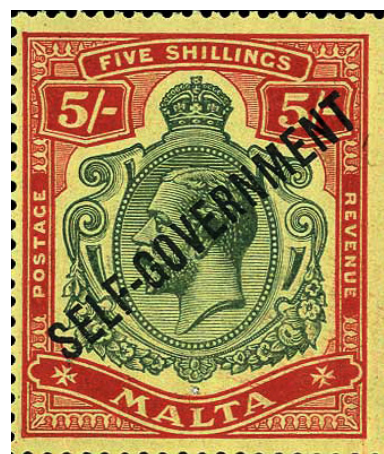
Malta stamp of 1922 with self-government overprint