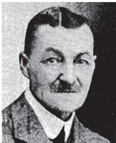
Governor Sir David Campbell

Fis-snin ta' wara, sa qabel it-Tieni Gwerra Dinjija u matul is-snin tal-gwerra, is-sitwazzjoni politika baqgħet strettament taħt il-kontroll Brittaniku u l-Maltin kellhom jistennew sal-1947 biex seta' jkollhom, mill-ġdid, xi sehem fit-tmexxija ta' pajjiżhom.