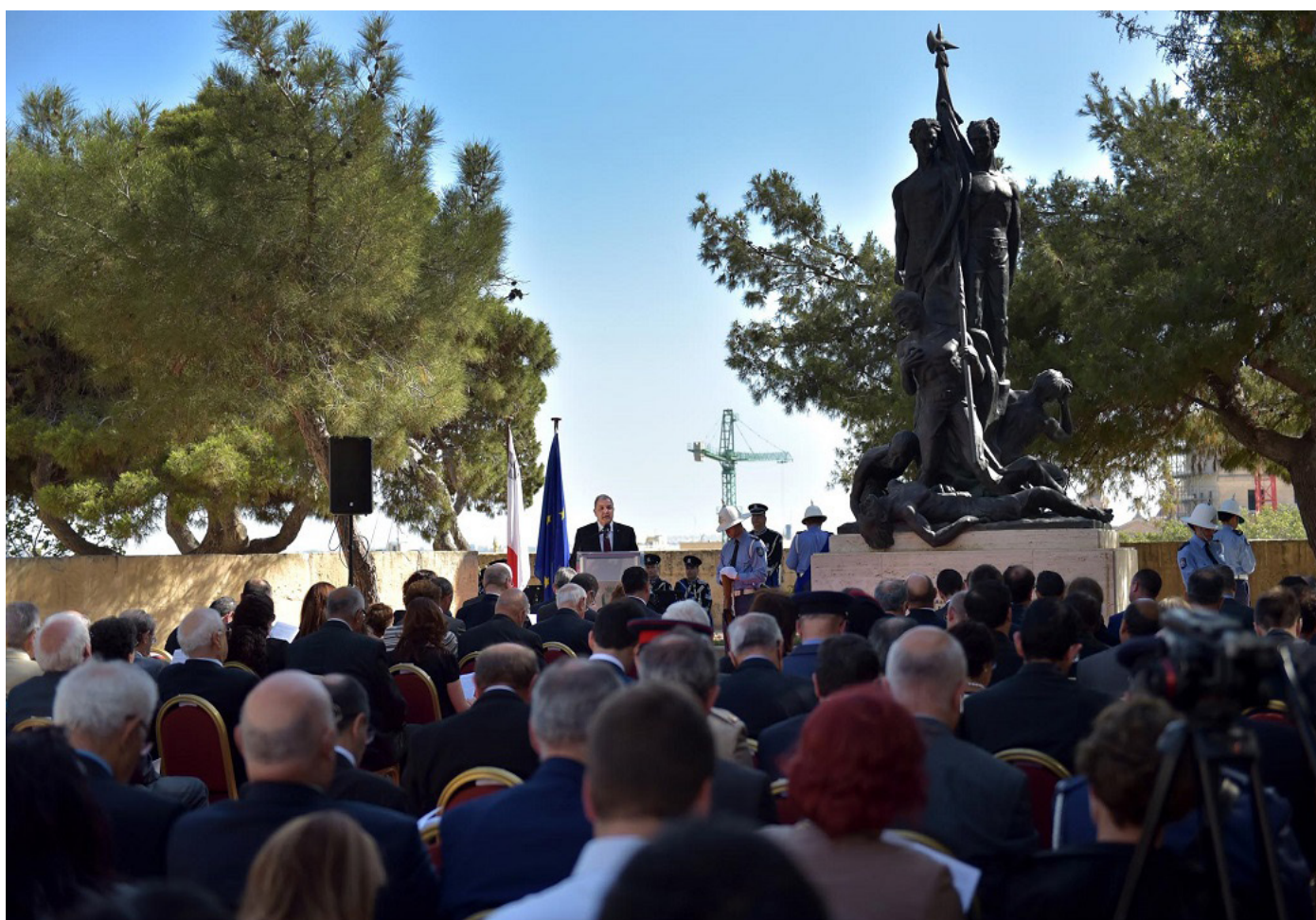
L-I-speaker Anġlu Farrugia jagħmel id-diskors fl-okkażjoni tat-tifkira tal-avvenimenti tas-Sette Giugno.

kondizzjonijiet, mingħajr theddid u mingħajr biza', sabiex il-Parlament Malti jkun dejjem f'pożizzjoni aħjar li kif jixraq, jindirizza t-tamiet u l-aspettattivi dejjem akbar tal-poplu Malti u Għawdx i kollu.