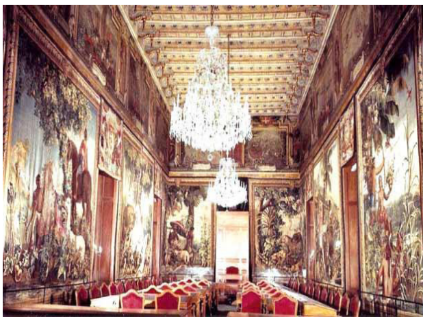
House of Representatives in 1921