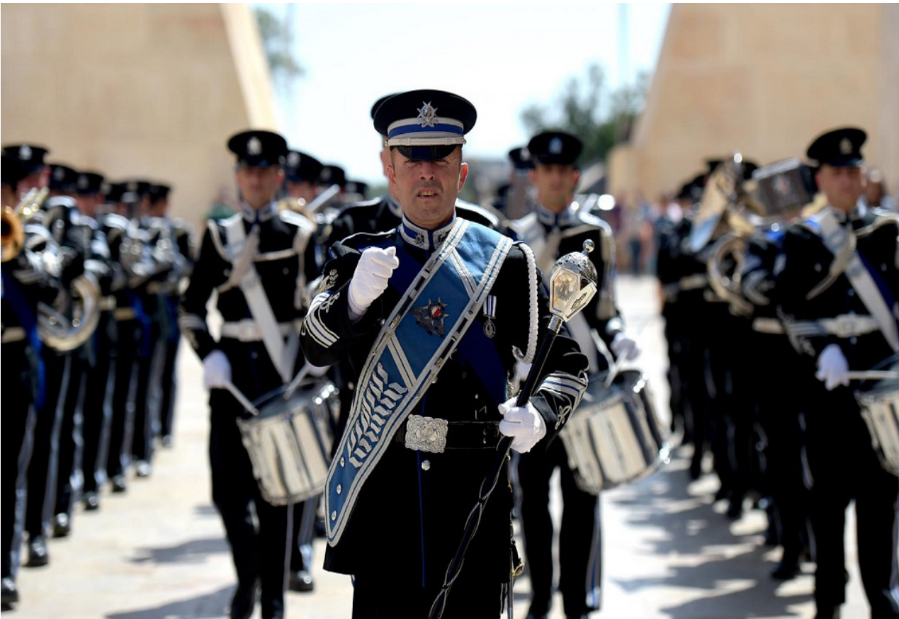
The Police Corps Band marches from the Parliaments building to the Sette Giugno Monument at Hastings Gardens.

I have to say that there is a lot that we all need to learn until we really manage to be exemplary at all times. There is always something left to be learnt but certainly we should not give up. We have to keep on striving to see how we can carry out our work with more dignity and respect. Each and every one of us in Parliament, and whoever works in this Institution, has the duty to do his part freely and at all times, without conditions, without threats and without fear, so that the Maltese Parliament will always be in a better position, as it should be, to address the ever increasing aspirations and expectations of all the people of Malta and Gozo.